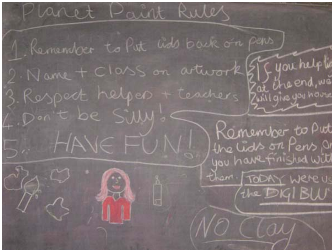
Some of the rules of Planet Paint have been written on the blackboard for everyone to see.