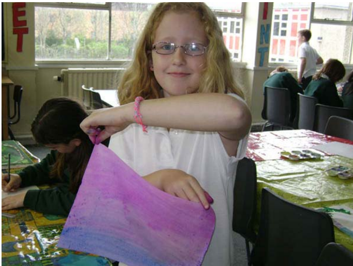
You can paint pictures of anything you haven't seen before!