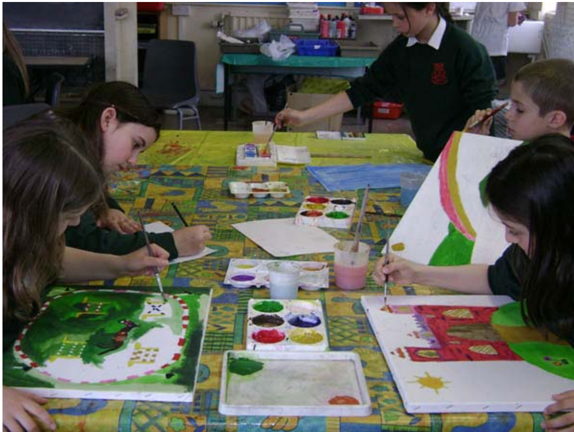
The children concentrate on their paintings so they turn out really good