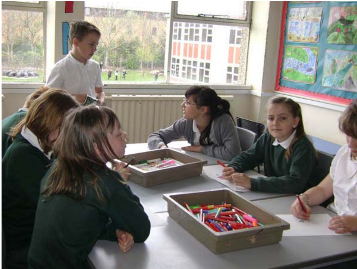
Drawing at Planet Paint