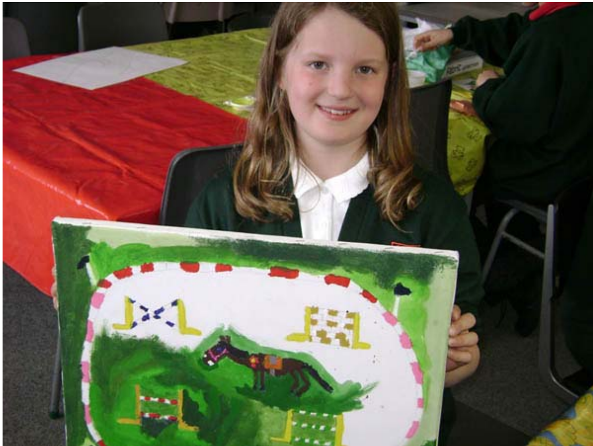
You can make and paint canvases at Planet Paint and it can go up on exhibition