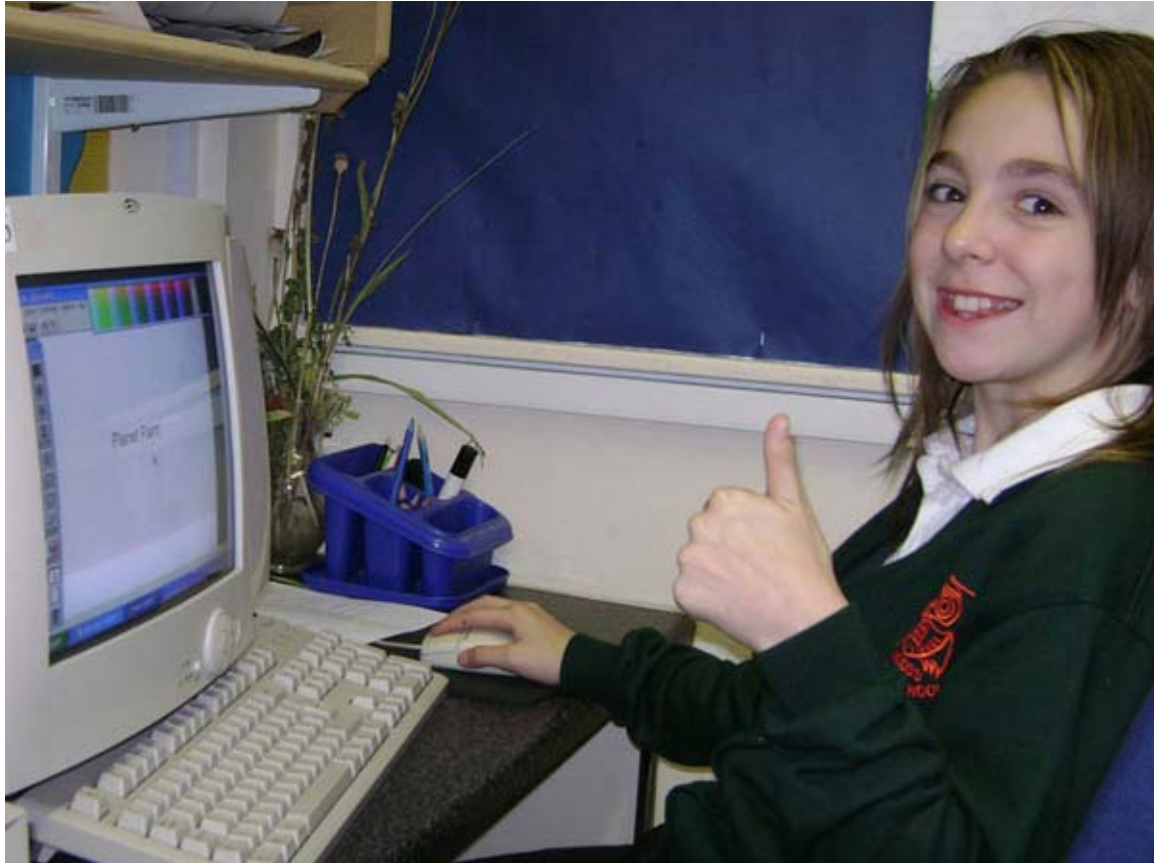
Working on the computer is also part of being on the committee